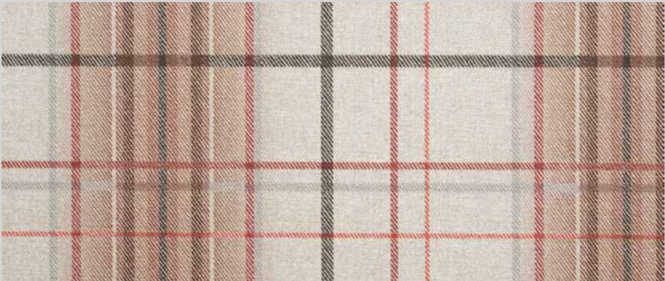
Oscar 774 Nutmeg/Red