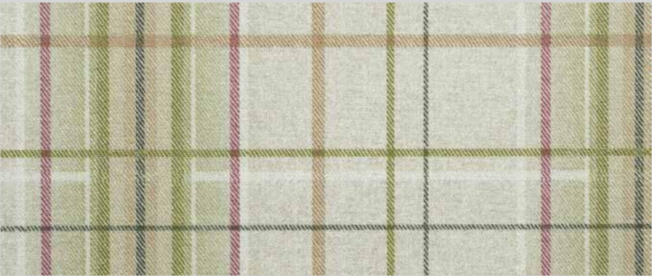
Oscar 239 Olive/Stone