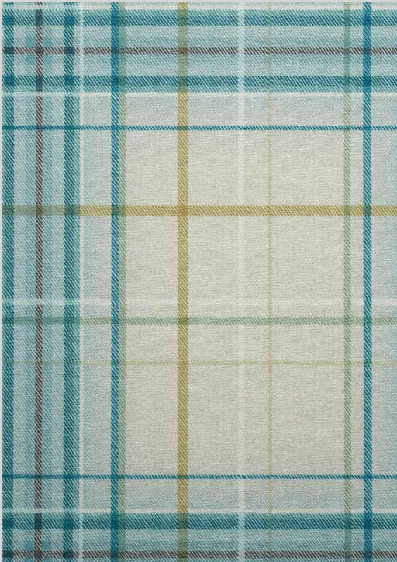
Oscar 272 Jade/Fawn