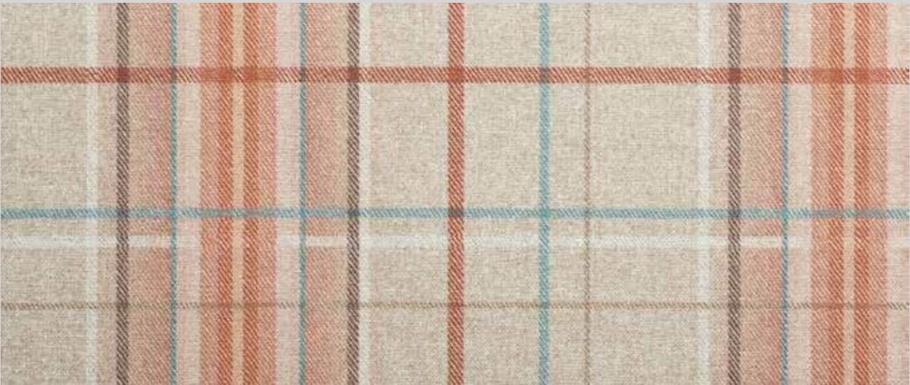
Oscar 428 Terracotta/Jade