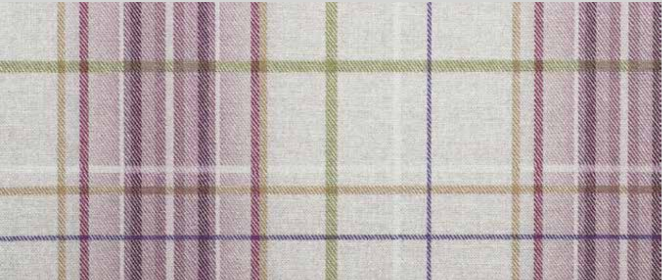
Oscar 627 Mulberry/Olive