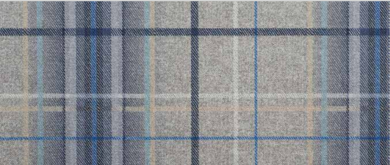
Oscar 195 Ink/Steel